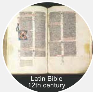
Latin Bible 12th century

Ekuphathaniseni amavesi njengoba ecashunwe eThestamenteni Elisha ngokubonakala kwawo eThestamenteni Elidala, kufanele sikhumbule ukuthi iThestamente Elidala emsukeni walo lalibhalwe ngesiHebheru nesi-Aramayikhi, nakuba ababhali beThestamente Elisha babecaphune kakhulu esihumushweni sesiGriki seThestamente Elidala. Isihumusho sesiGriki seThestamente Elidala saziwa ngokuthi iSephthuwaginti. Uma iThestamente Elisha licaphuna isiGriki seSephthuwaginti, kunokuba kube yisiHebheru seThestamente Elidala, izihumusho ezithile ziyakukhombisa lokhu ngeLXX ezithendeni zamavesi acashuniweyo (isib. UMathewu 1:23). Kulezi zimo, singakulindela-ke ukuthi okucashunwe yiThestamente Elisha kweThestamenteni Elidala ngeke neze kuze kufane ncamashi, igama negama, ngokomsuka wokwakheka kwesiHebheru.